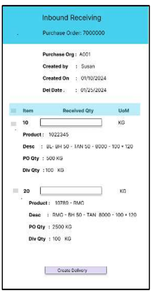
Fig. 2 Delivery creation screen