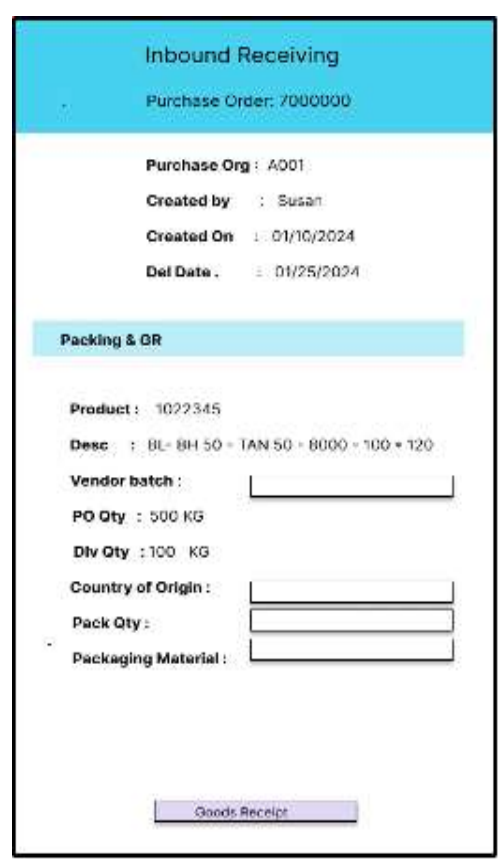
Fig. 3 Packing and goods receipt screen

4. Solutions by using the Mobility Application