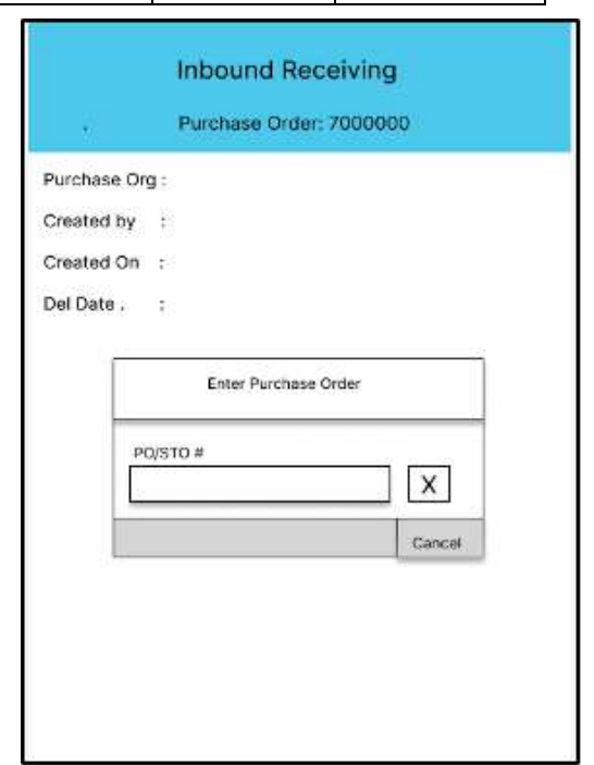
Fig. 1 Purchase order home screen